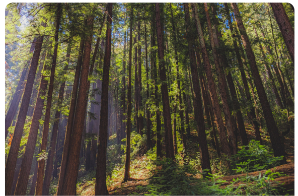
Reinhardt Redwood Park