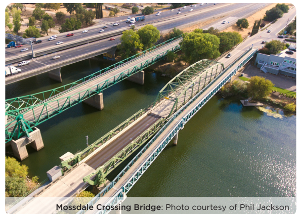
Mossdale Crossing Bridge