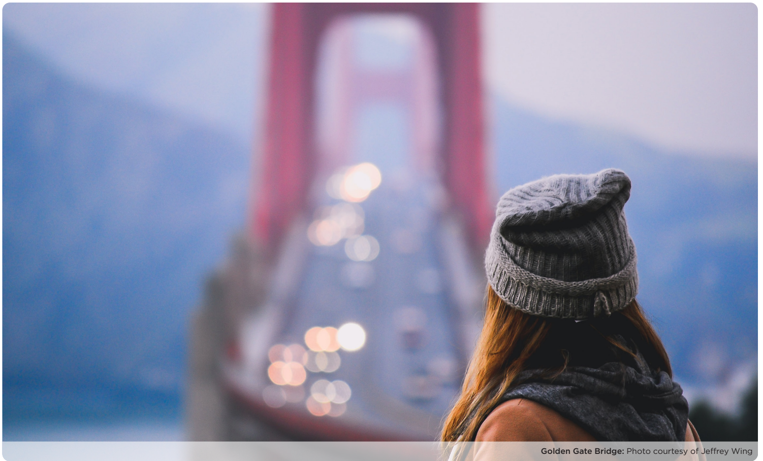
Golden Gate Bridge: Photo courtesy of Jeffrey Wing