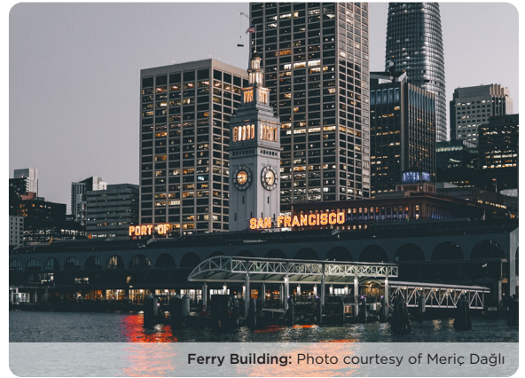
Ferry Building

Other points of interest include: Alphabet/Google, Apple, LinkedIn, Netflix, Winchester Mystery House, San Jose State University, SAP Center - San Jose Sharks, Children's Discovery Museum, Happy Hollow Park & Zoo, Murphy Street Farmers Market, Japanese Friendship Garden, Montalvo Art Center, Mountain Winery, California's Great America, and the Gilroy Garlic Festival.