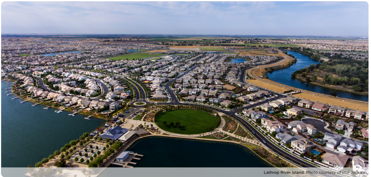
Lathrop River Island: Photo courtesy of Phil Jackson