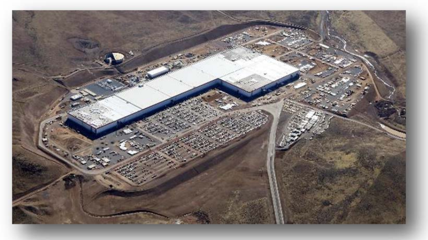
Gigafactory 1 Expansion in Progress

We continue to evolve our service function as well. In Q4, we reduced service backlog in our busiest markets by 25%, and by year end we had increased the number of cars serviced per day by 45% since Q3'16, and by 95% since Q1'16. In fact, we are on track to reduce the global average wait time for vehicle service to less than one day by the end of the first quarter of 2017.